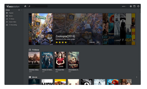
Personal Multimedia Bank

Real-time video streaming provides hassle-free and high-quality video playback among various devices.